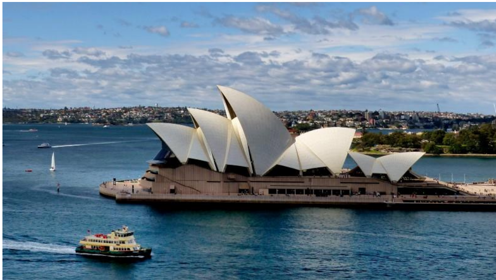
Sydney Opera House on Sydney Harbour